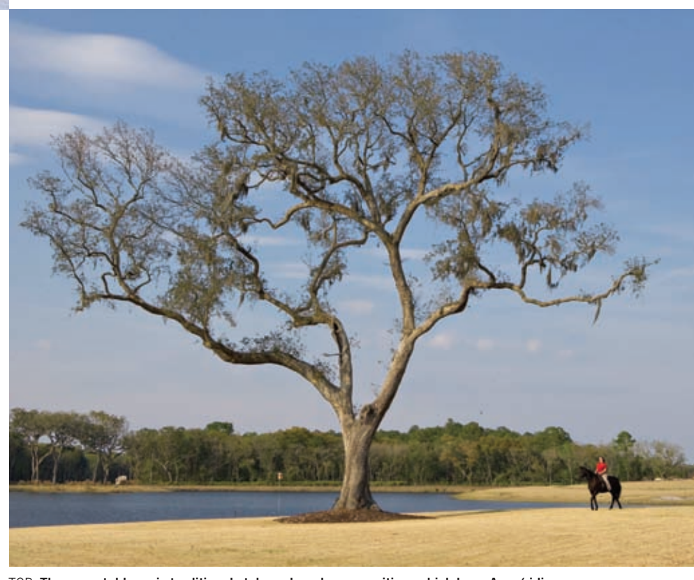
TOP: The new stables mix traditional style and modern amenities, which have Amy (riding Boots) cantering merrily along. ABOVE: Full-grown live oaks were carefully relocated to the new stables' stunningly beautiful 40-acre site.